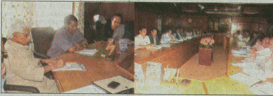
NCST members holding a review meeting with state officials.

KOHIMA, AUG 8 (NPN): High powered committee of National Commission for Scheduled Tribe (NCST) Thursday assured to take up and support the requirements and problems of Nagaland with the Central government.