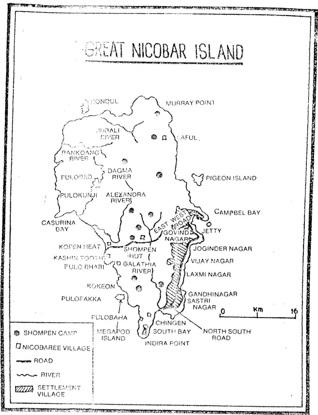
Map 2. The Great Nicobar Island